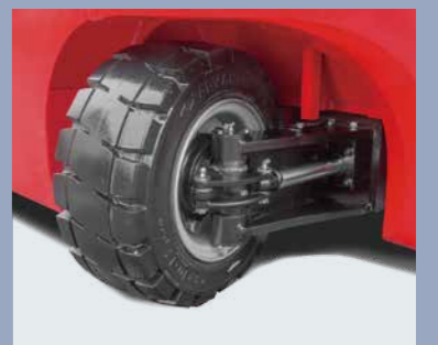
Smaller turning radius