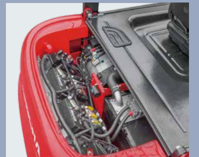
Easy for maintenance