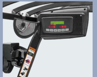
Easy to see display